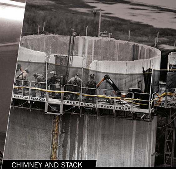
CHIMNEY AND STACK